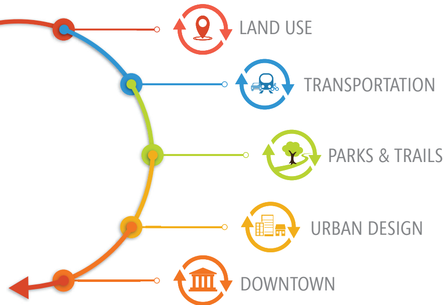
Figure 1.1 | Texarkana Comprehensive Plan Components

Another critical aspect of regulatory authority is Extraterritorial Jurisdiction (ETJ), which allows local governments to exercise authority outside the designated city limits. Based on the current population, Texarkana has a two mile ETJ beyond the city limits where the city can impose limited regulations. Renew Texarkana will make recommendations for the current city limits and the ETJ area (assuming that the ETJ land would be incorporated during the lifetime of the plan).